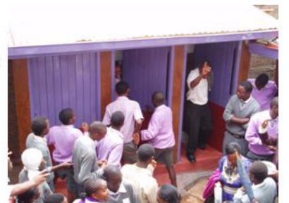
Form 4 students celebrate the new toilets at Akiba.

In addition to the study hut, Akiba also built three new Asian style toilets. The toilets were welcomed by staff and students alike. We attended a special ceremony to bless the new facilities with water from the River Jordan.