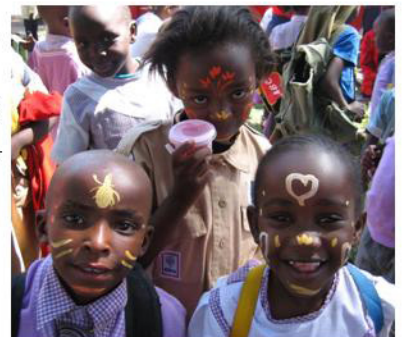
Primary children enjoy face-paint at the Trade Fair.